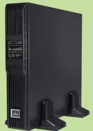
Liebert GXT3 mini-tower model provides 1000VA capacity in a compact design.